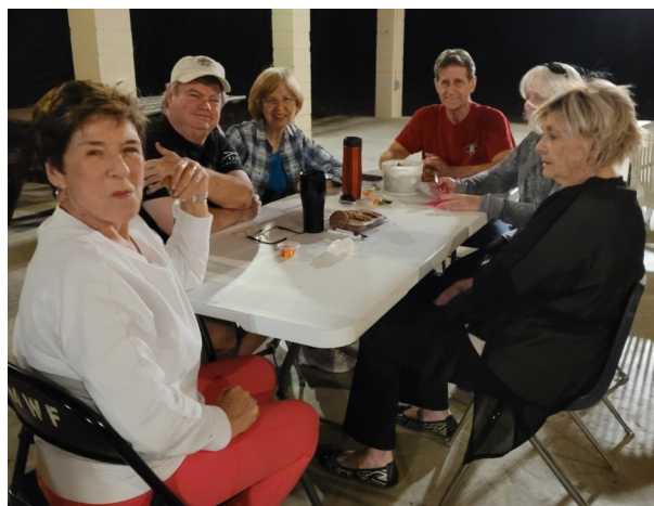
Old Farts Rule