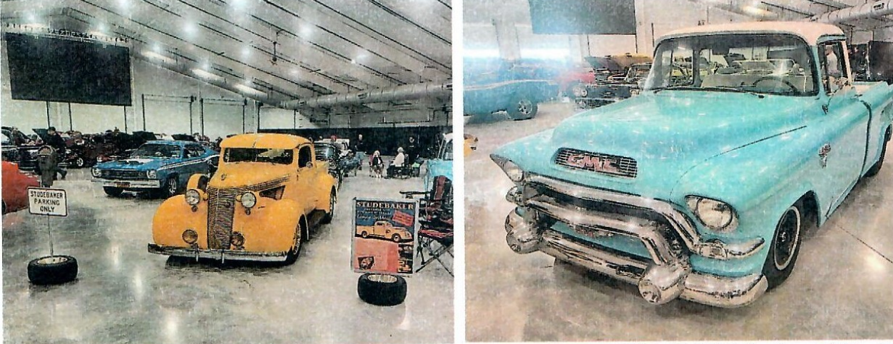
Jeff Rice – 1937 Studebaker J5 Coupe Express